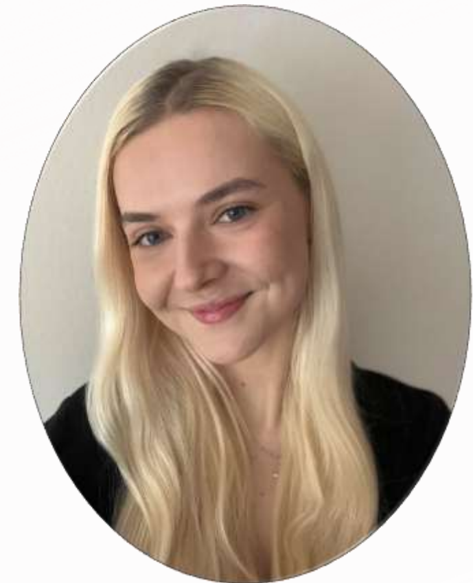
MILENA Customer support